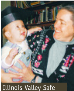
Illinois Valley Safe House Alliance

When the PGE Foundation sprang to life in 1997 as a permanently endowed philanthropic nonprofit, our goal was not to change the world.