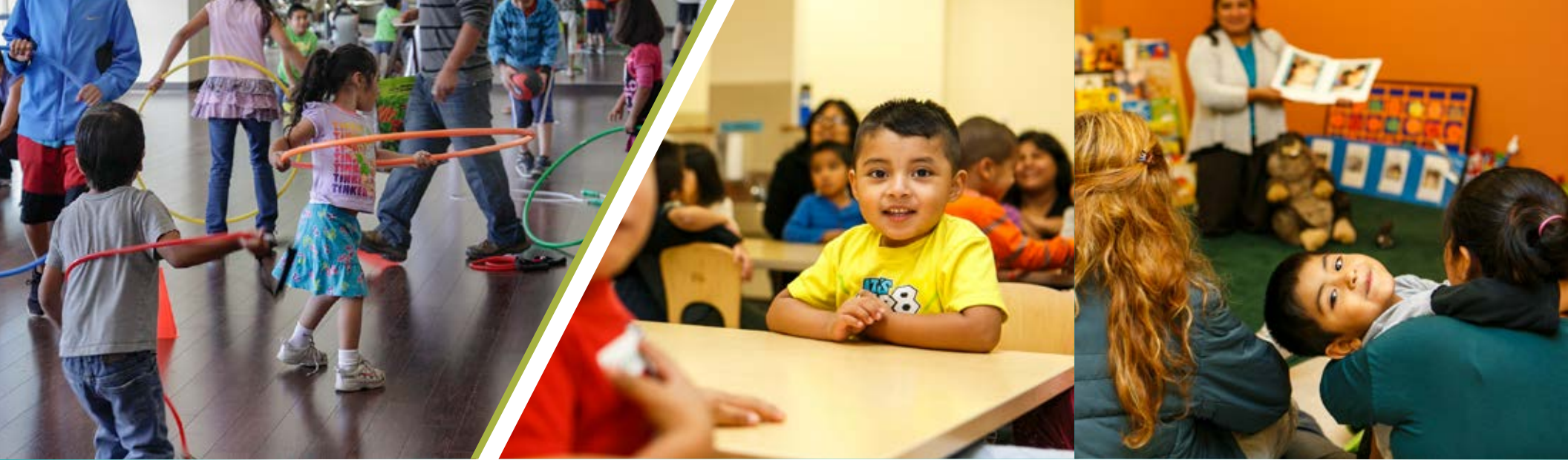
Virginia Garcia Cornelius Children's program / Adelante Mujeres